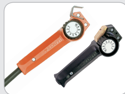
R10 and R11-T

The two remote control options add convenience and cost-efficiency to your welding operations. Using R10 enables welding parameters to be set conveniently at welding site. The wireless R11-T adds even more freedom and easier mobility.