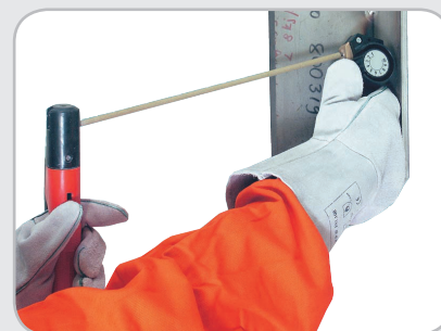
R11-T wireless remote control units can be used simply by touching the electrode